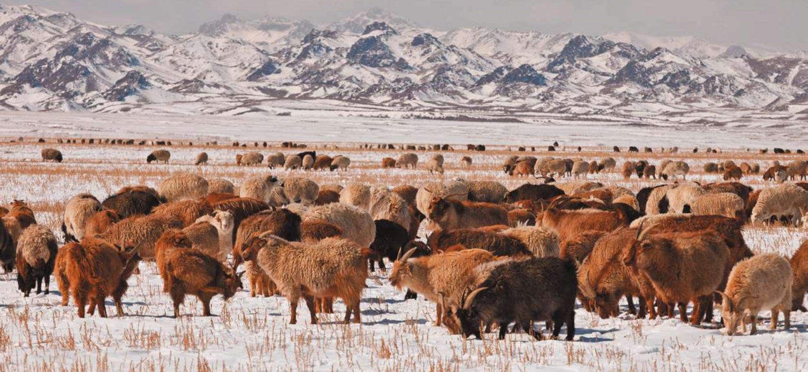
Domestic goats and sheep can graze marginal lands, such as those in the Gobi Desert in Mongolia.